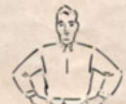
Offside or violation of free-kick rules