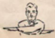
Incomplete forward pass—penalty declined—no play or no score