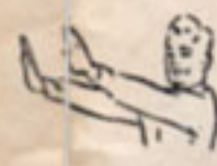
Interference with fair catch or forward pass