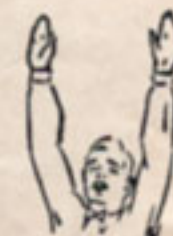
Touchdown or field goal