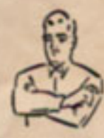
Delay of game or excess time out