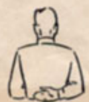
Illegal forward pass

You never outgrow your need for foods made with MILK!