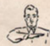
Illegal motion at snap