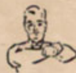
Holding by defense