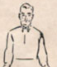
Crawling, pushing or helping runner